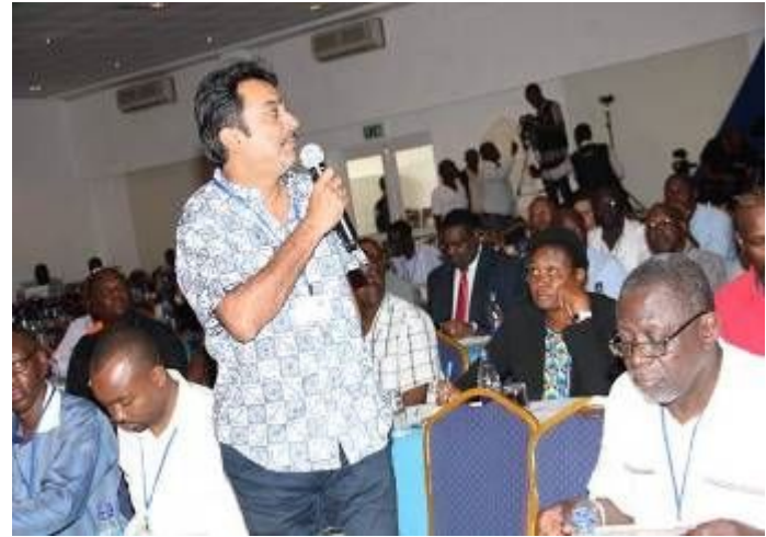
Delegates during the 1 st Annual Devolution Conference held on April 1-5, 2014 at the Leisure Lodge Beach and Golf Resort, Mombasa