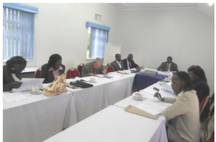
Council, Committee members and the Secretariat during the Breakfast Workshop on the review of the CPS Syllabus held at the CPS Governance Centre

Some of the areas discussed in the workshop include the title and structure of the examinations, the validity of each papers/subjects in the syllabuses in meeting market needs, a clear description of the objectives of each paper/subject in the syllabuses, the content which should be included in the current syllabuses to make them more relevant, the content which should be removed if considered inappropriate having regard to the current and future market environment, among others.