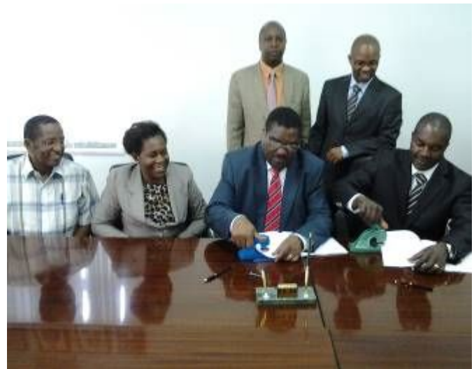
The Board of Directors of the CPS Governance Centre Ltd and Cadplan Architects Ltd sign a Consultancy contract on the development of the CPS Governance Centre.