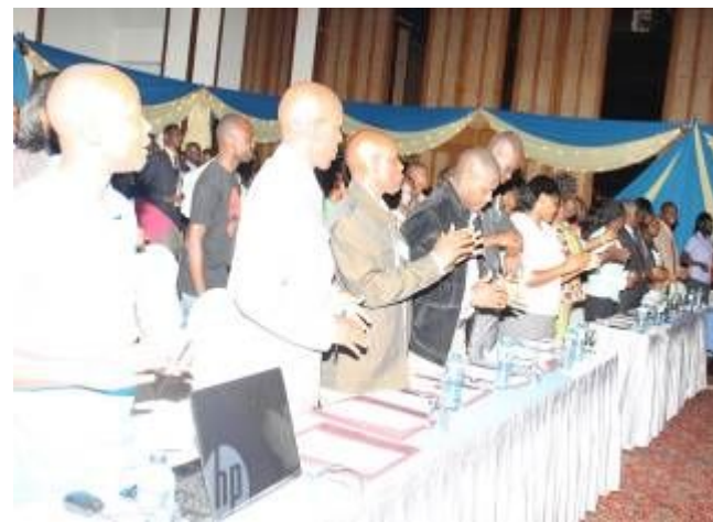
Guests during the KASNEB Prize Award Ceremony held at the Laico Regency Hotel, Nairobi