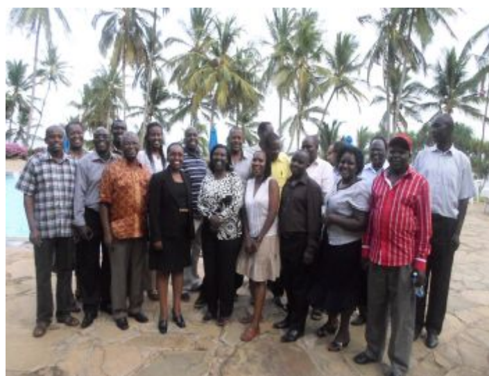
Participants during the Seminar on Corporate Governance and Board Evaluation at the Flamingo Beach Resort, Mombasa