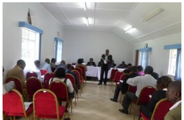
Members during the 13 th ICPSK Sacco Society Limited Annual General Meeting

The Sacco membership application forms are available at the ICPSK website www.icpsk.com .