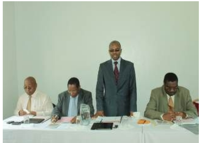
Board of Directors of the CPS Governance Centre Limited during the Annual General Meeting

The Board of the Company and the Council of the Institute continues to encourage members of the Institute to purchase shares and invest in the Company in order to realize the development of the Institute's office complex. For details on how to purchase the shares, please visit our website www.icpsk.com or contact the Institute Secretariat.