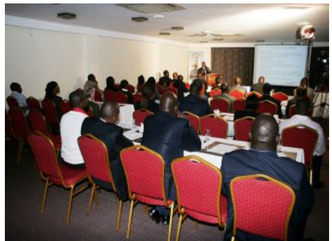
Members of the Institute during the 13 th Governance Forum