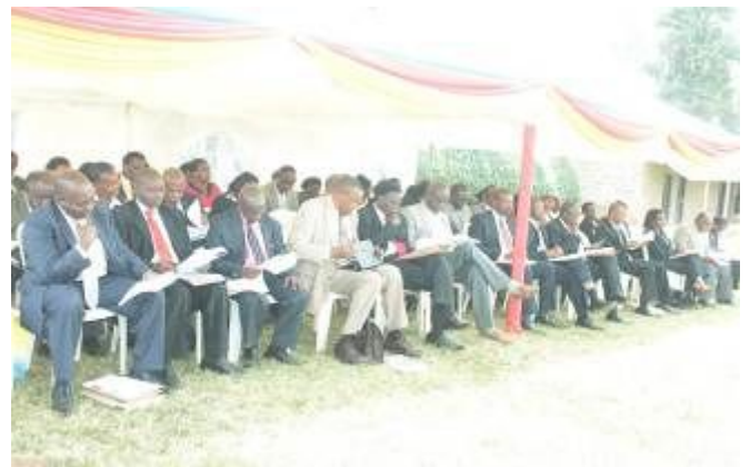
Members of the ICPSK during the Annual General Meeting

During the Annual General Meeting, the Institute launched a governance framework to guide the Certified Secretaries in County Governments in the discharge of their duties.