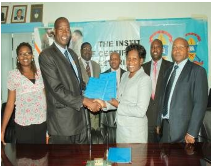
The former Chairman of the Institute exchanges the signed Memorandum of Understanding with the Vice-Chancellor of The Management University of Africa