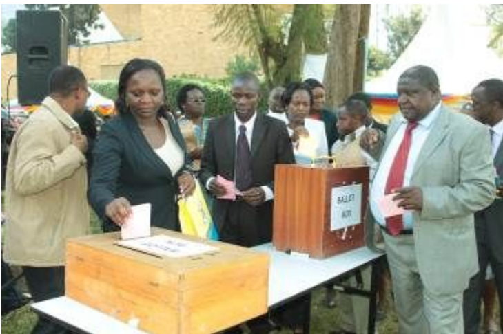
Members of the ICPSK cast their votes during the Annual General Meeting