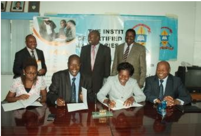
The Institute signs a Memorandum of Understanding with The Management University of Africa

The Institute and the Management University of Africa will mutually promote governance and ethics in Kenya. They will enhance capacity in institutions to entrench good governance and integrity in order to restore confidence in service delivery both in the private and public sectors.