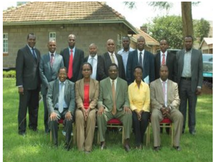
CPS Governance Centre Limited Annual General Meeting held on May 16, 2014