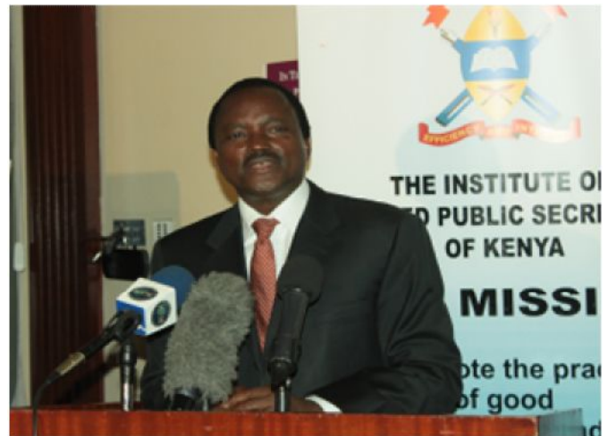
H.E CS. Stephen K. Musyoka, former Vice-President of the Republic of Kenya speaks during the Launch